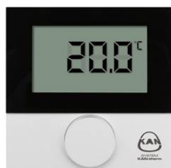
Thermostat with LCD Standard - heating 230 V/24 V