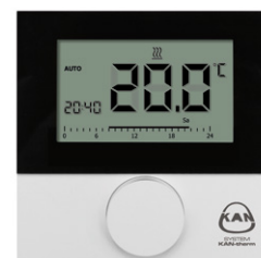
Thermostat with LCD Control - heating/cooling 230 V/24 V