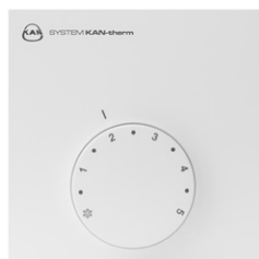
Analogue thermostat Heating 230 V/24 V