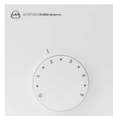
Analogue thermostat - heating/cooling 230 V/24 V