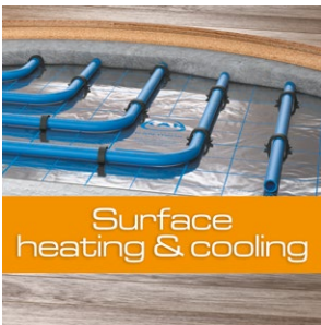
Surface heating & cooling

KAN was established in 1990 and has been implementing state of the art technologies in heating and water distribution solutions ever since.