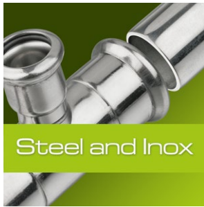
Steel and Inox